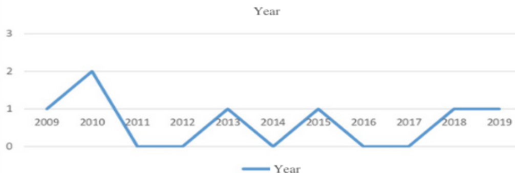
Graph 1: Year of Publication

According to the technical analysis regarding the year of publications, in 2010 there was a small increase in the number of published productions, which is still not considerable to stand out quantitatively in the following years. With the exception of the years 2011, 2012, 2014, 2016, 2017, we found the constant of one publication per year within the research clipping. As shown in Graph 1 below: